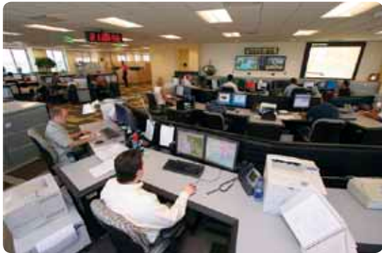
Jeppesen's San Jose, California ITP Ops Center.

We support your operations with a 24/7 team of experts and complete services that augment your flight department and allow for efficient worldwide operations. To extend your flight department's capabilities and maintain or improve safety standards, pilots, aircrew and operational staff need services that let them meet their global transportation requirements. Our team performs your dispatching and trip-planning tasks in a coordinated environment, and brings our aviation expertise into your flight department. We fill any operational gaps and make your business more capable and efficient.